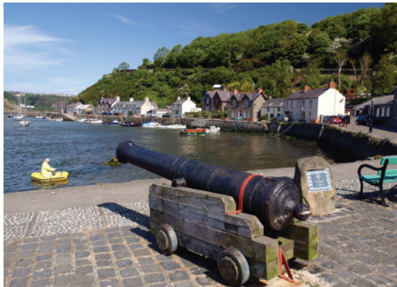
Lower Fishguard, which masqueraded as Dylan Thomas's famous village in Under Milk Wood.