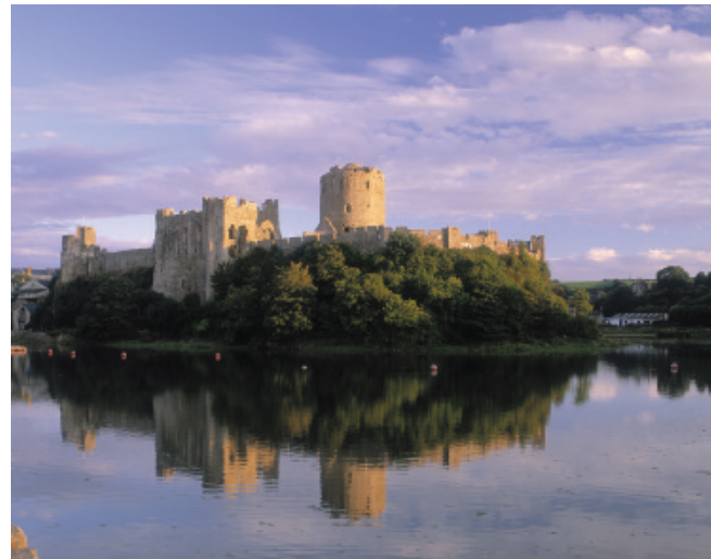
Above: Pembroke Castle – birthplace of Henry Tudor, who became King Henry VII.